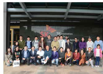
Visit to Industrial Site