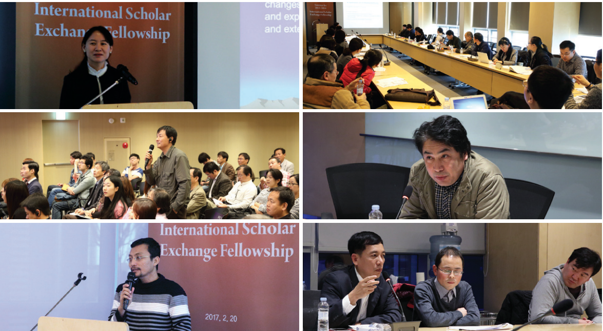
Academic seminars by ISEF fellows

dations. You may download the form at the KFAS homepage. (“Community”→“Download”→“Letter of Recommendation.doc”)