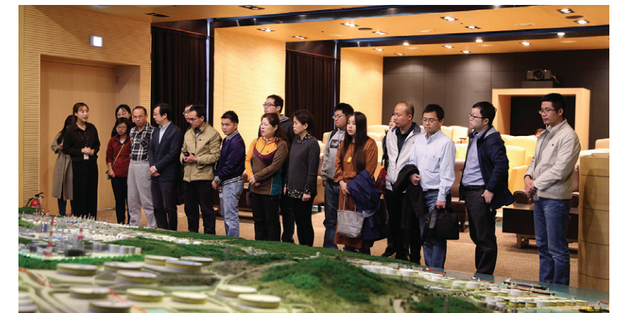
SK Energy Ulsan Complex Visit