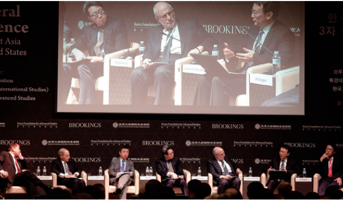
China-US-ROK Trilateral Conference

KFAS launched China Lecture Series II in 2016 and invited prominent Chinese, European and American scholars to give lectures. From February 2016 to September 2017, 15 Chinese scholars and 2 scholars from Europe and America have delivered talks on topics including economics, international politics, philosophy, society and history. KFAS plans to continue to invite foreign experts on China on a variety of topics including culture, education and media.