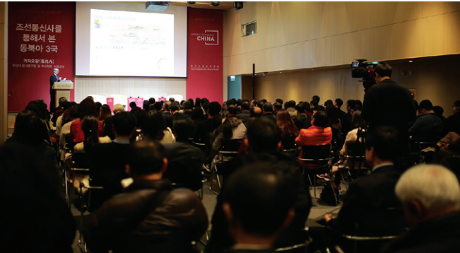
China Lecture Series