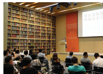
Korean Language Presentation