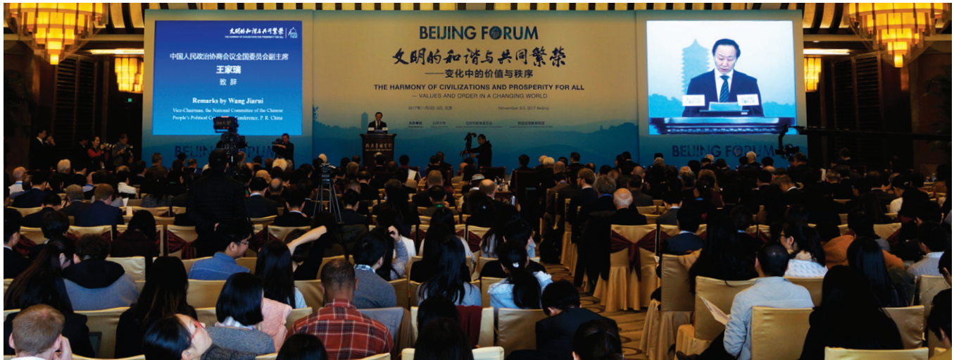
2017 Beijing Forum

KFAS and Renmin University of China have agreed to host the International Forum on Confucianism and the Law Forum biennially from 2015 onwards and the first Law Forum celebrating the 800th anniversary of the Magna Carta was held on September 5 to 6, 2015, at Renmin University under the overarching theme, “the Past, Present and Future of the Rule of Law.” The International Forum on Confucianism was held on December 2 to 3, 2016 under the theme, “Family, State, and Kingdom in the Horizon of Confucianism”, followed by the Law Forum on “Culture, the Rule of Law and Social Development” on November 18 to 19, 2017.