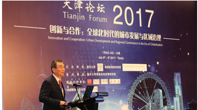
2017 Tianjin Forum