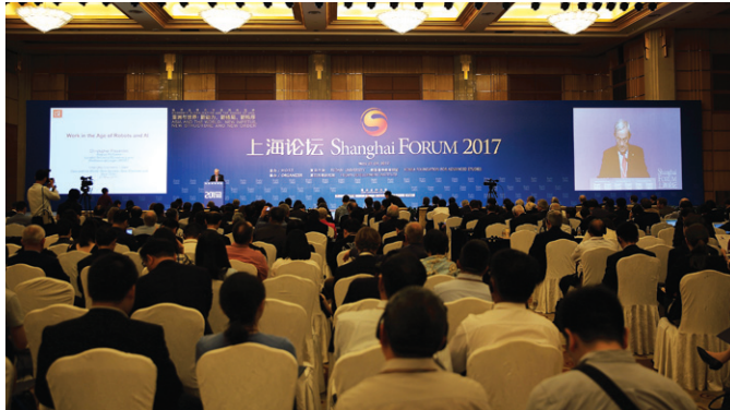
2017 Shanghai Forum

Forum with the Asia Media Research Center of Communication University of China to discuss the latest research in the fields of journalism, communication, media, new technologies, digital content, and related policies.