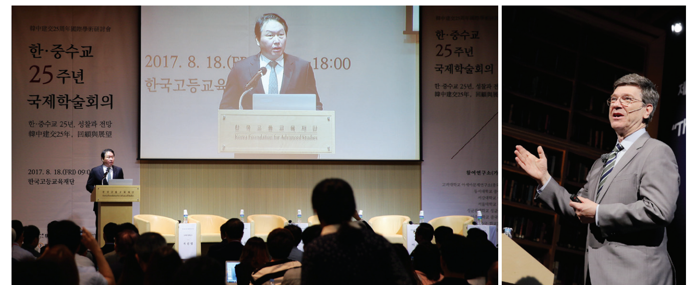
International Conference Commemoration 25 Years of Korea-China Diplomatic Relations