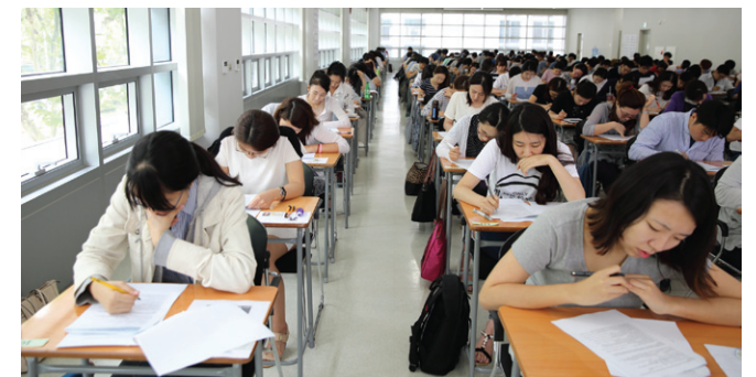
Scholarship Program Exam