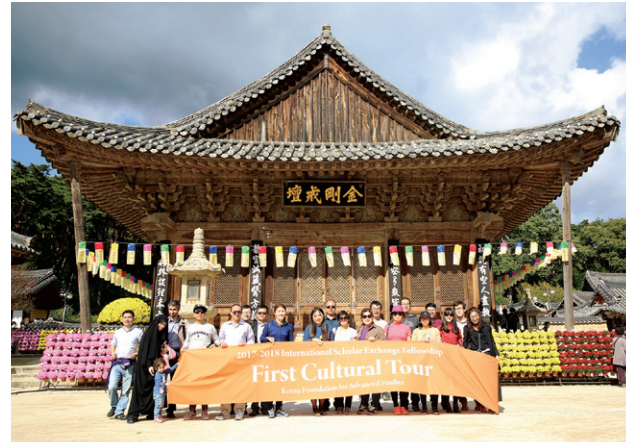
First Cultural Tour for 2017-2018 ISEF Fellows

Fellows are required to submit progress reports on the proposed research project on November 15, 2018 and February 15 and May 15, 2019.