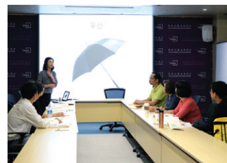
Korean Language Class