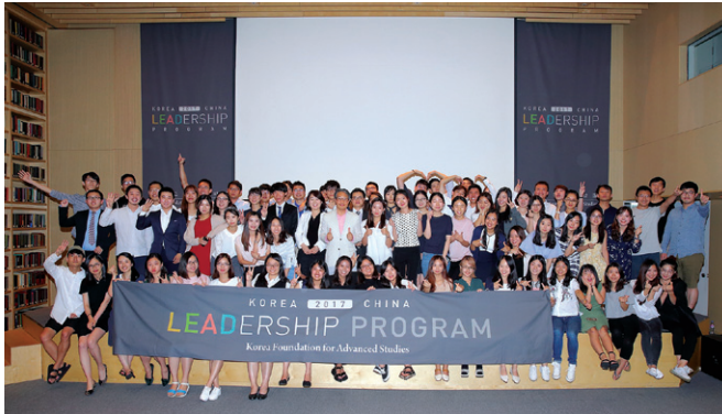
Korea-China LEADership Program