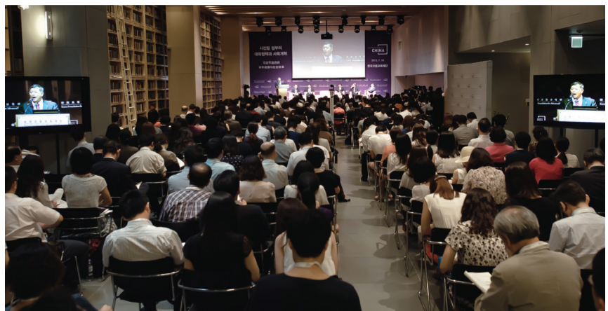
KFAS Conference Hall