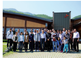
Visit to Afforestation Plant