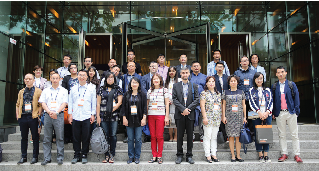
Arrival of 2017-2018 ISEF Fellows, in front of KFAS headquarters.

Laos, Malaysia, Mongolia, Myanmar, the Philippines, Thailand, Uzbekistan and Vietnam. They have successfully begun conducting their proposed research in collaboration with their host scholars at 11 major universities and research institutions in Korea. The ISEF program provides outstanding scholars with comprehensive research expenses during their stay in Korea, which include round-trip airfare, initial settlement support, a monthly research stipend, research paper publication support, and accident insurance. During their stay in Korea, fellows enjoy full access to KFAS facilities including the seminar rooms and library to help their research.