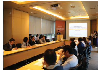
Orientation for the ISEF Fellows